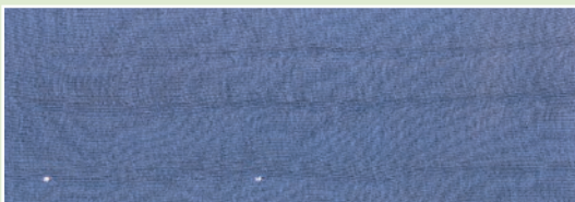
With CEFASOFT ECO-SEW